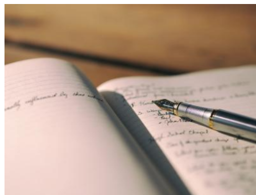
INMATE TESTIMONIES - PAGE 2 & 3