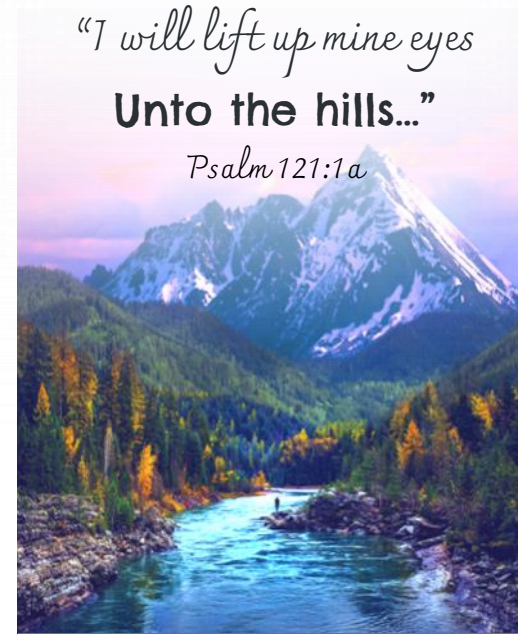
DEAR SUPPORTERS - PAGE 1