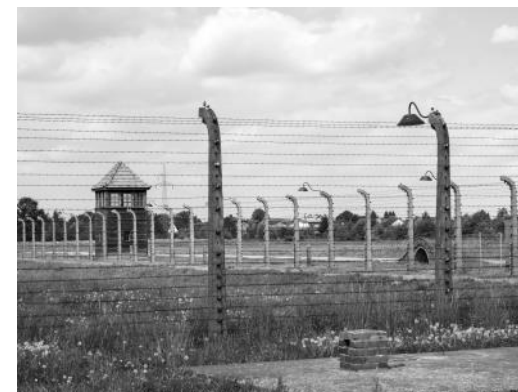
INMATE RESPONSES - PAGES 2 & 3