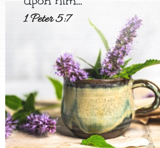
DEAR SUPPORTERS - PAGE 1

It seems we so quickly become burdened with the cares of this life. I was reading in 1 Peter 5 and noticed this verse again; "Casting all your care upon him; for he careth for you." This word "casting" is the same Greek word that is used when the disciples "cast" their garments on the donkey that Jesus rode on during the triumphal entry into Jerusalem. It was a good mental picture for me to think about — the disciples were no longer carrying their coats, the donkey carried them. In the same way, we need to place our burdens and cares upon the Lord so that He can carry them.