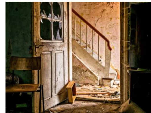
INMATE TESTIMONIES - PAGE 2 & 3