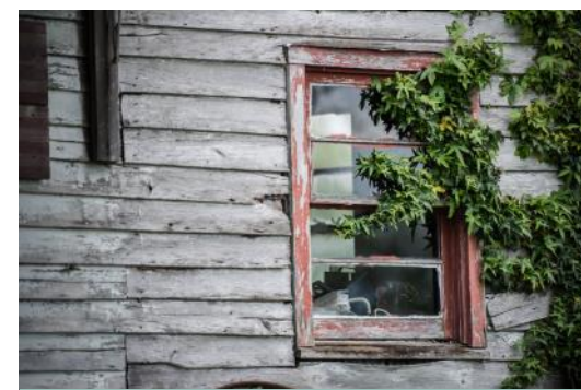
BECOME INVOLVED - PAGE 4