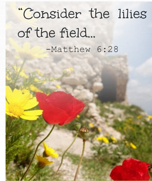
DEAR SUPPORTERS - PAGE 1