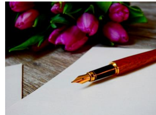
INMATE TESTIMONIES - PAGE 2 & 3