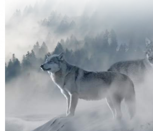
DEAR SUPPORTERS - PAGE 2