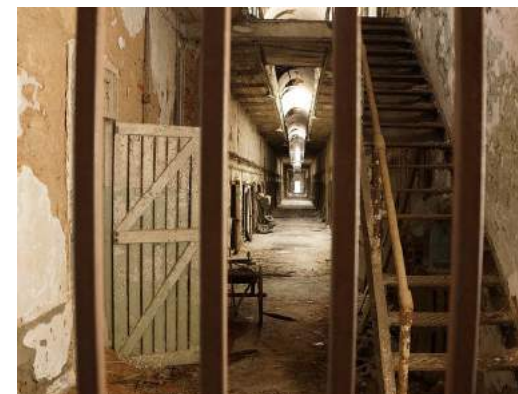
INMATE RESPONSES - PAGES 1 & 3