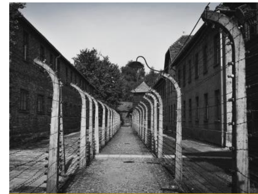
INMATE RESPONSES - PAGE 2