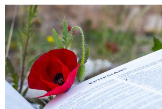
FACTUAL SPICE - PAGE 3