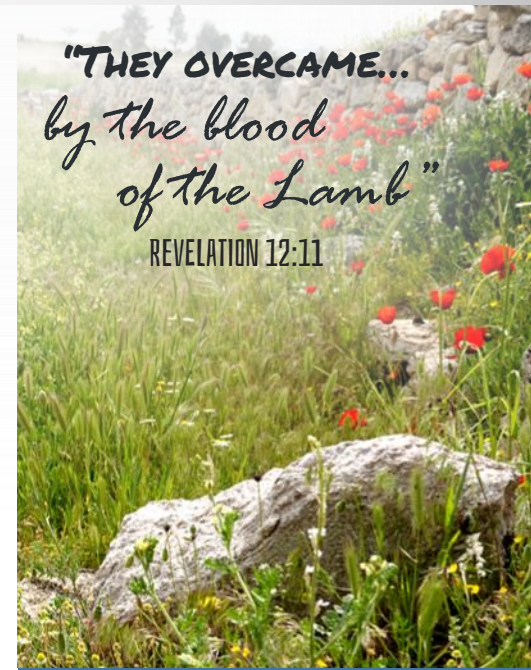
DEAR SUPPORTERS - PAGE 1