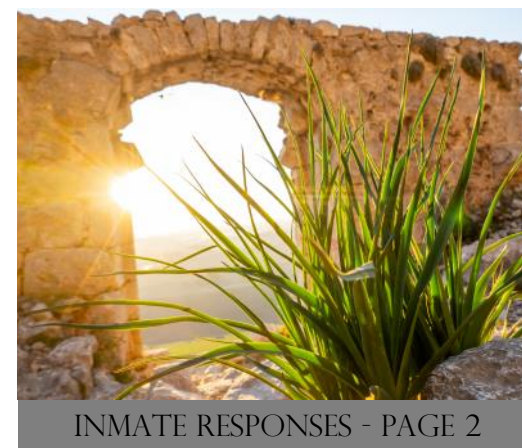
INMATE RESPONSES - PAGE 2