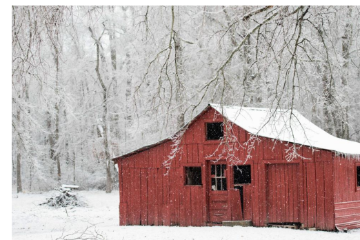
ANNUAL REPORT - PAGE 3