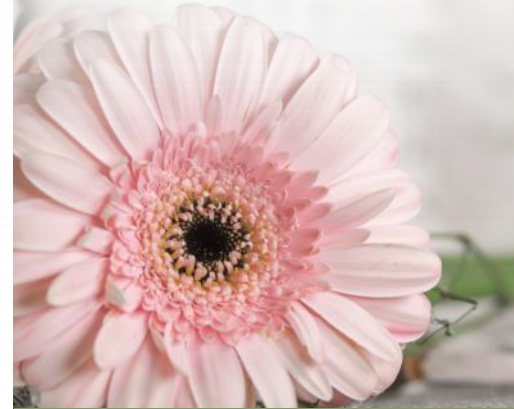
DEAR SUPPORTERS - PAGE 1

"AS FOR ME, I WILL CALL upon God;" Psalm 55:16