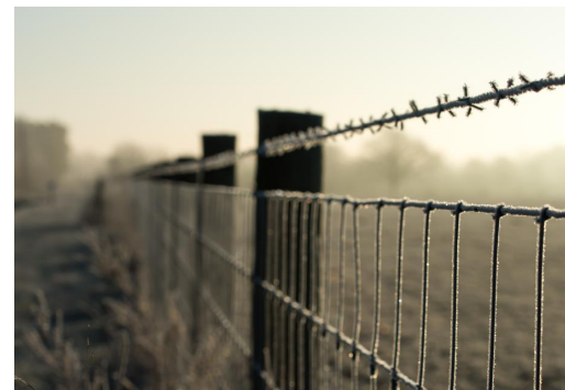
ANNUAL REPORT - PAGE 3